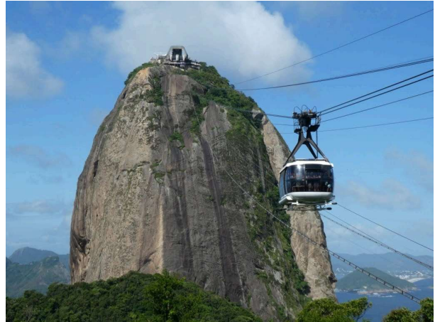
Selaron Steps / Sugarloaf or Pao de Acucar

Day 4 Fly Fox Iguacu Brazil and Puerto Iguazu. Early morning flight GOL Airlines G3 9006 06:50am, arriving 09:00am 2hr to Brazil's Fox Iguacu Airport. We transfer by chartered transport 15min to nearby Brazil Iguacu National Park. There are baggage lockers at the entrance for our big luggage. We also visit the nearby Parque das Aves Bird Park, home to many colourful birds which includes a humming bird aviary. By late afternoon, we cross border into Argentina by chartered transport for our overnight stay in Puerto Iguazu. O/N Puerta Iguazu ( Iguacu Park Entrance BRL100, Bird Park entrance revised BRL80, baggage lockers and transfers is covered ). Option for members to take the Gran Aventura 2hr boat ride where one is guaranteed to get wet. June 2024 price is USD99