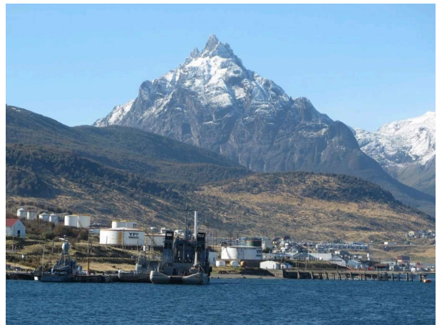
End of the World signboard at Ushuaia / Mount Oliva dominating Ushuaia

Day 10 El Chalten. We fly from Ushuaia with Aerolineas Argentinas AR1895 11:20am, arriving El Calafate airport 12:40noon.. We use chartered transport to travel north to El Chalten 200km 3hr. Rest of stay free to relax and enjoy the views of Mount Fitz Roy jagged peaks. O/N El Chalten.