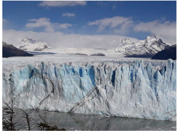
Mountainscape at El Chalten / Perito Moreno Glacier width 5km length 30km

Day 13 Puerto Natales (Chile). We take the morning public bus 6hr to Puerto Natales crossing into Chile Patagonia. Immigration is strict here, so NO fresh items inside baggages. It is the gateway to Torres del Paine National Park. Free rest of day to wander this small pretty town overlooking the Señoret Channel. This small town was founded back in 1911 for sheep ranching. O/N Puerto Natales Chile.