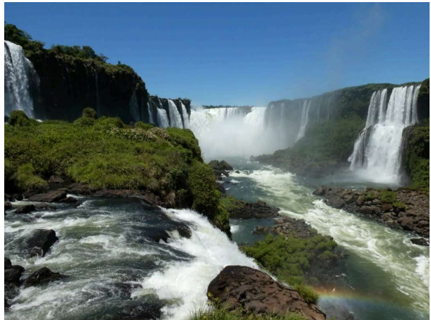
Iguazu Falls Argentina / Iguacu Falls Brazil side

This will be a small group backpack trip using 6 domestic flights, local buses and airport taxis . We stay in decent clean guesthouses, apartments and budget hotels ranging from 2 to 5 pax sharing units . It is essential that members travel light as several of the domestic flights have 15 kilos check in baggage limit . Participants must be able to manage their own luggage and light medium trolleys are acceptable . Like most Yongo trips, you pay for your own meals. We have included most of the main entrance fees on this trip. Tours/entrances not mentioned below will be payable by members. You also pay within-the-town taxis and other activities not specified below.